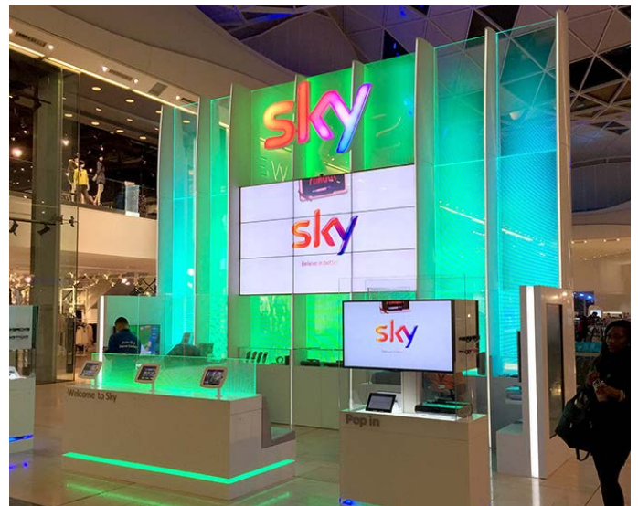
Sky's iconic light wall in London's Westfield White City