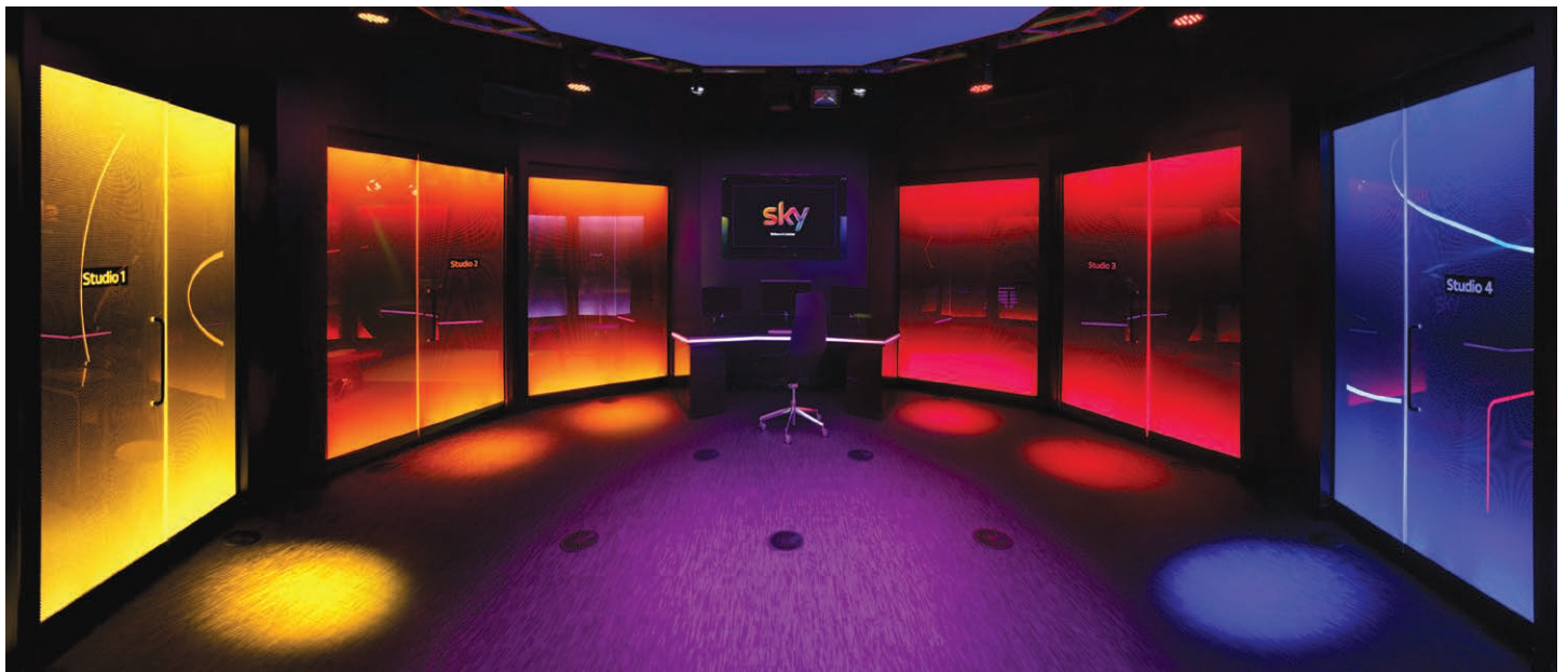
Dynamic edge-lit glass partitions and doors to the four Skills Studios at Sky TV's headquarters in London