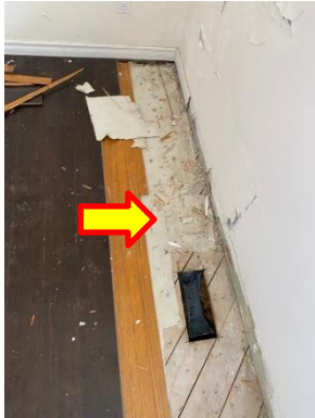
Asbestos-containing paper insulation found under original hardwood flooring, Bedroom, 2 nd Floor, Location 15.