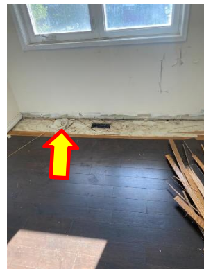
Asbestos-containing white paper insulation found under original hardwood flooring, Bedroom, 2 nd Floor, Location 14.