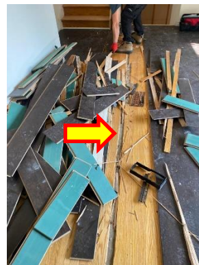
Non-asbestos paper insulation found under original hardwood flooring, Living room, Ground Floor, Location 6.