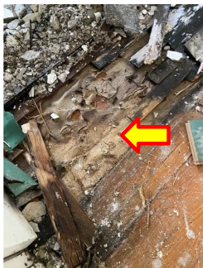
Asbestos-containing white paper insulation found under original hardwood flooring, Bedroom, 2 nd Floor, Location 13.