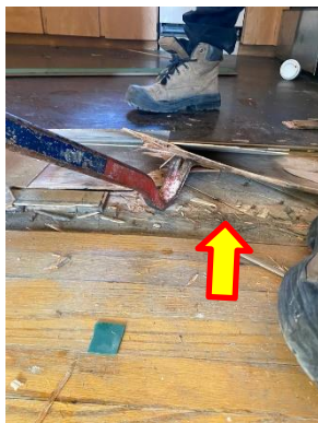
Non-asbestos paper insulation found under original hardwood flooring, Kitchen, Ground Floor, Location 7.