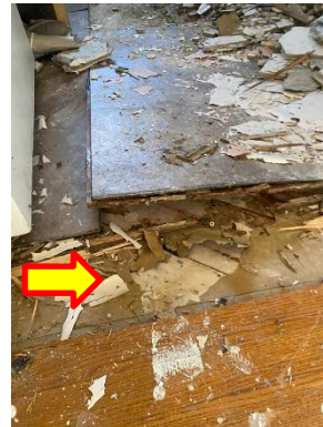
Non-asbestos paper insulation found under original hardwood flooring, Washroom, 2 nd Floor, Location 11.