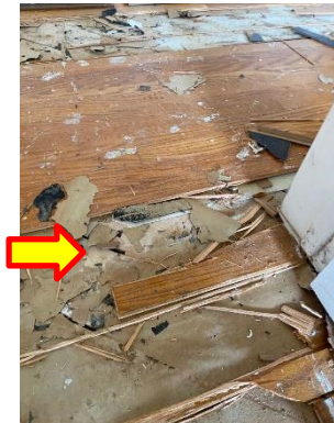
Non-asbestos paper insulation found under original hardwood flooring, Bedroom, 2 nd Floor, Location 16.