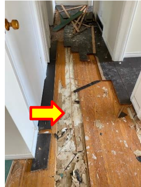
Asbestos-containing paper insulation found under original hardwood flooring, Corridor, 2 nd Floor, Location 17.