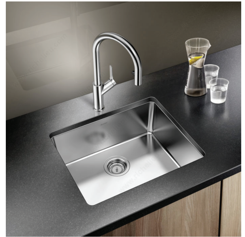
UNDERMOUNT SINK RICHELIEU BLANCO SINK - ANDANO U MED (SINGLE)