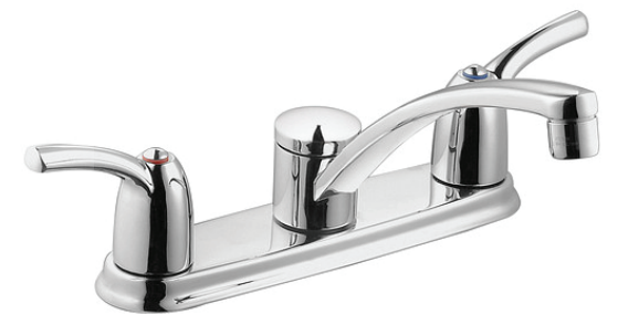
FAUCET - CHILD HEIGHT COUNTER MOEN ADLER CHROME TWO-HANDLE LOW ARC KITCHEN FAUCET