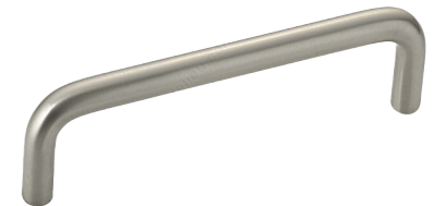
PULL HARDWARE RICHELIEU MODERN METAL PULL - 2288 BRUSHED NICKEL