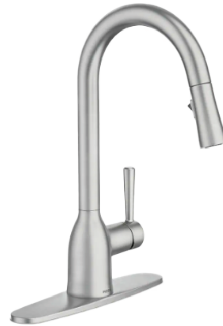
FAUCET - ADULT HEIGHT COUNTER MOEN ADLER SPOT RESIST STAINLESS KITCHEN FAUCET